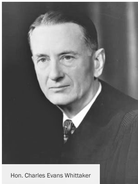
Hon. Charles Evans Whittaker

The Kansas City Star was a premier client of the firm, and firm partners became very close with its corporate leaders. One of the more famous cases in which the firm represented the Star was Kansas City Star Co. v. United States , 9 which charged the newspaper with violations of the Sherman Anti-Trust Act. Interestingly, this case followed Justice Whittaker's judicial path from the Western District of Missouri, to the United States Court of Appeals for the Eighth Circuit, to the decision to deny the petition for writ of certiorari in the United States Supreme Court. 10