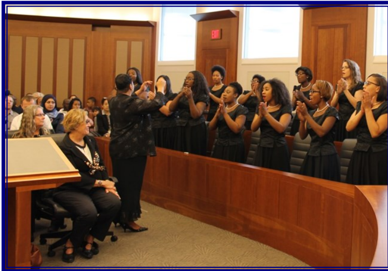
The University Women's Vocal Ensemble performs the National Anthem

Lincoln University Education students were given a sense of appreciation for the citizenship process by assisting the court on May 7, 2015, during the Central Division naturalization ceremony in Jefferson City. The event was an opportunity to collaborate with the University in order to offer students of L.U.'s Education and Cultural Diversity class a hands-on experience with the court as a community service learning project.