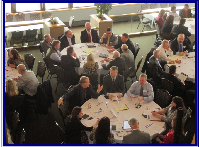
Participants enjoy round table discussions on various ethics topics.

After the program, a reception followed for the participants and the judges to socialize for much needed one on one time, developing camaraderie amongst the bench and bar.