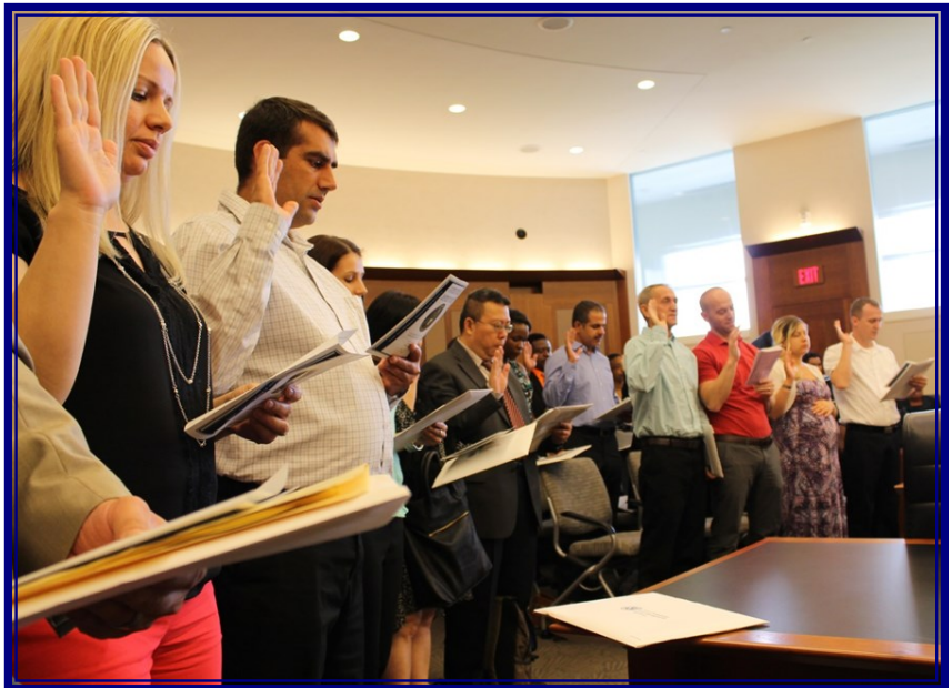
New United States Citizens take their Oath of Allegiance.

The students expressed the presentation and tour helped to prepare them for their role on the ceremony day and it gave them a bigger sense of involvement and appreciation for the process that marks the end of a long citizenship process. The naturalization topic-specific education tour will now be offered to schools and organizations as a new community outreach opportunity in the Central Division.