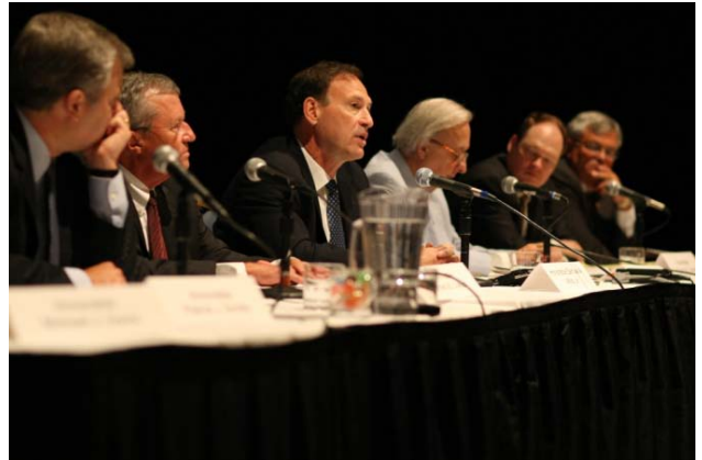
Justice Samuel A. Alito Jr. answers questions from the audience

As with most conferences, the true benefit was the dialogue between judges and their colleagues, and between the judges and the lawyers who practice before them. This sharing continues to produce a “best practices” mentality for all those who work for and with the federal courts. Unfortunately, as law firms reduce expenses in these economic times, it becomes harder for practitioners to attend the conferences—missing out on the benefits of in-person information exchange. But the good news is that the Western District will be hosting the event in August 2012. This should give Kansas City lawyers a great chance not only to participate, but also to contribute to both educational and social event planning.