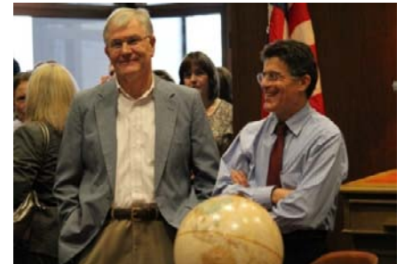
Judge Benton and Judge Federman