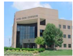
Southern Division at Springfield United States Courts United States Courthouse 222 N. John Q. Hammons Parkway Springfield, Missouri 65806 spfdgen@mow.uscourts.gov