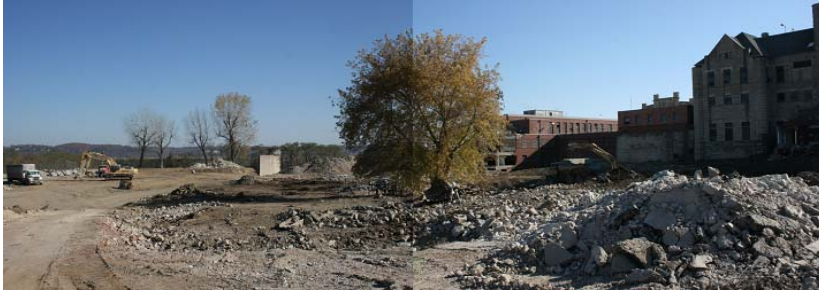
The late stages of demolition on site of the new Jefferson City Courthouse