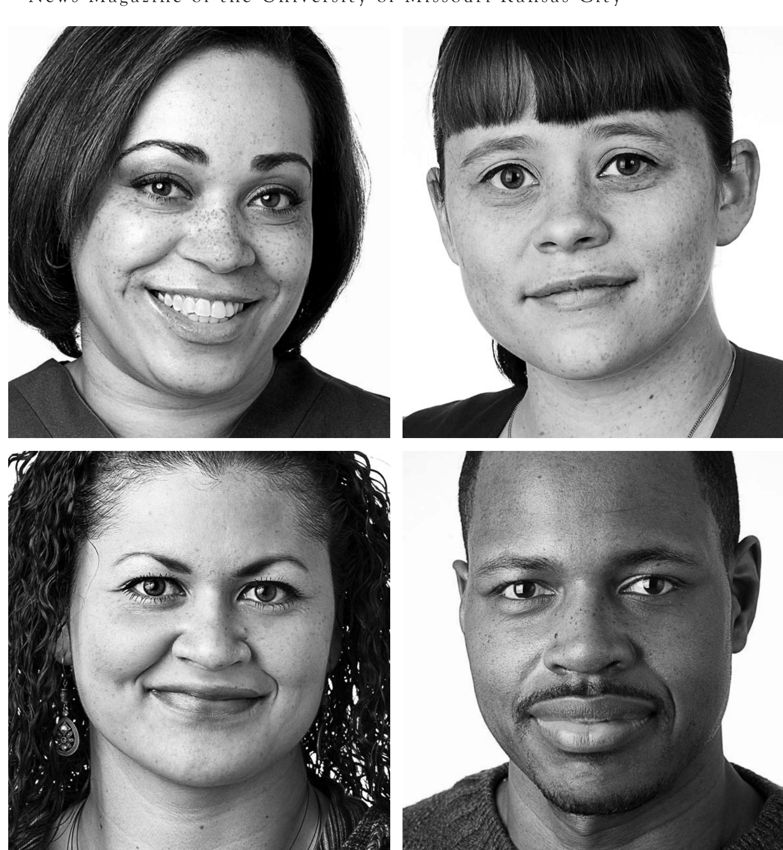
Starting Over Personal challenges led these students to rediscover their ultimate purpose

News Magazine of the University of Missouri-Kansas City