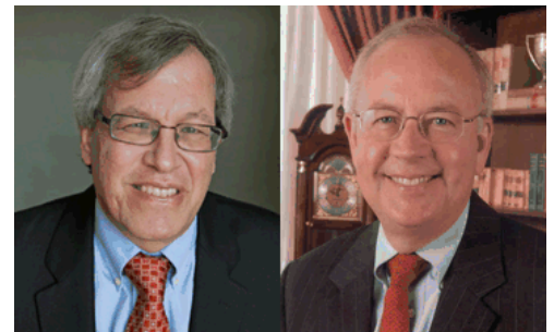
Dean Erwin Chemerinsky

Three hours, Missouri and Kansas pending (one hour, ethics)