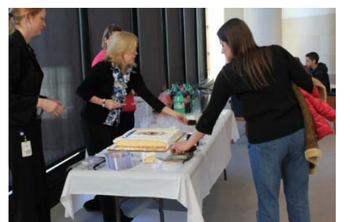
Family members enjoy refreshments.