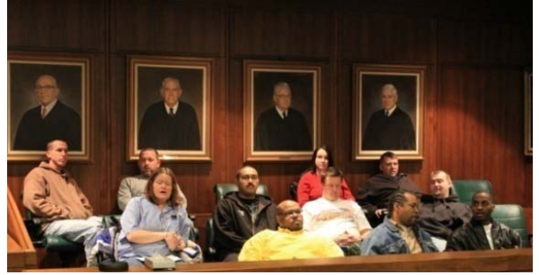
Re-Entry Court participants